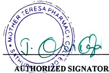
AUTHORIZED SIGNATORY MOTHER TERESA PHARMACY COLLEGE