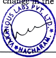
AUTHORIZED SIGNATORY VARANOUS LABS PRIVATE LIMITED