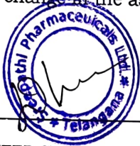
AUTHORIZED SIGNATORY SREEPATHI PHARMACEUTICALS LIMITED