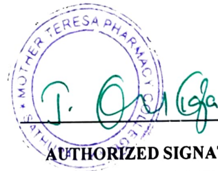
AUTHORIZED SIGNATORY MOTHER TERESA PHARMACY COLLEGE