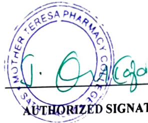
AUTHORIZED SIGNATORY MOTHER TERESA PHARMACY COLLEGE