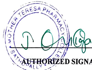
AUTHORIZED SIGNATORY MOTHER TERESA PHARMACY COLLEGE