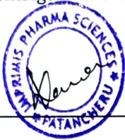
AUTHORIZED SIGNATORY IMPRIMIS PHARMA SCIENCES